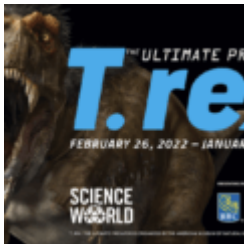
T. rex: The Ultimate