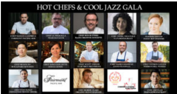
Fundraiser Gala at the Fairmont Pacific Rim – Hot Chefs Cool Jazz Gala Fundraiser