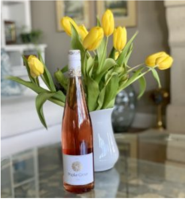
Culture Tastic – an interactive, virtual cooking event April 18, 2022