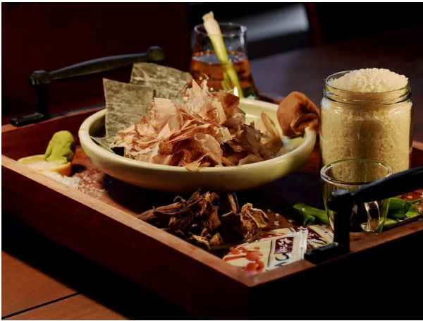
Naramata Inn April Promotions, New Events and Mother's Day Brunch April 18, 2022